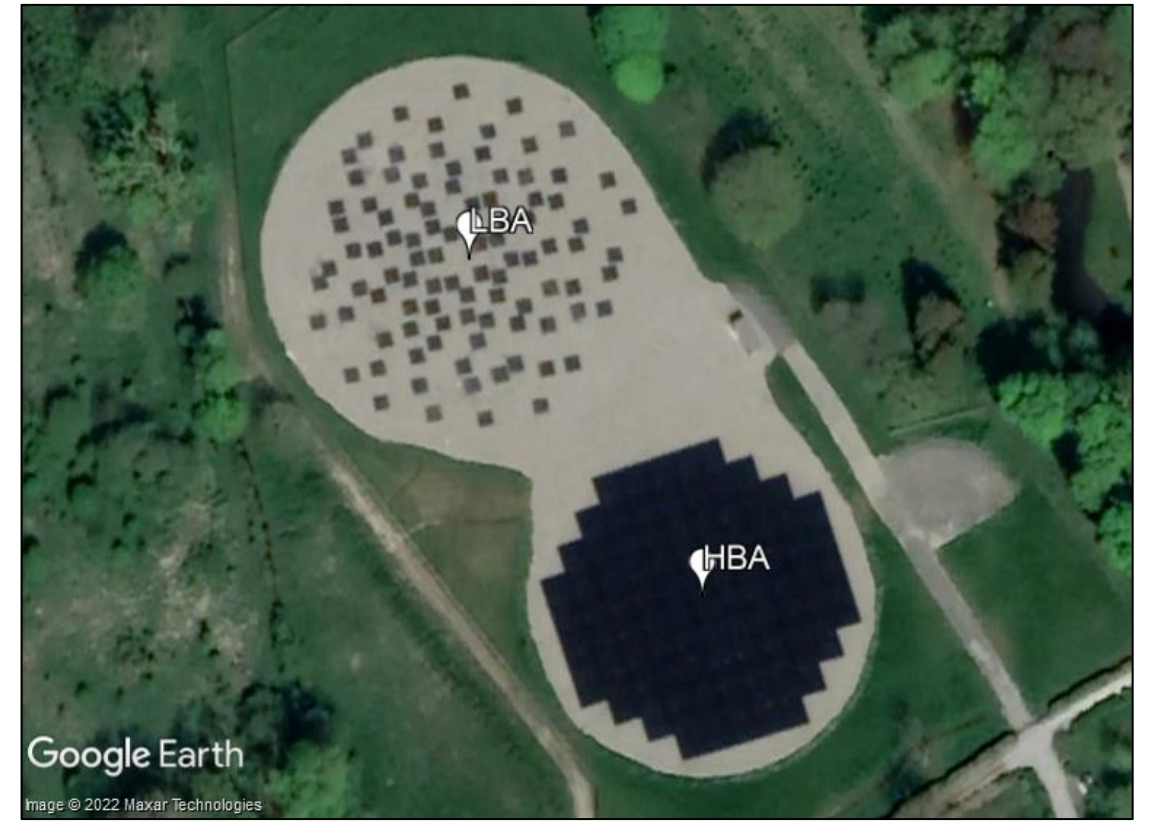
Figure 3 I-LOFAR anntenae

LOFAR makes observations in the 10 MHz to 240 MHz frequency range with two types of antennas: Low Band Antenna (LBA) and High Band Antenna (HBA), optimized for 10 – 80 MHz and 120 – 240 MHz, respectively. These are not tabulated within this report as there are 94 LBA and 97 HBA locations. The I-LOFAR antennae locations are shown in Figure 3 below.