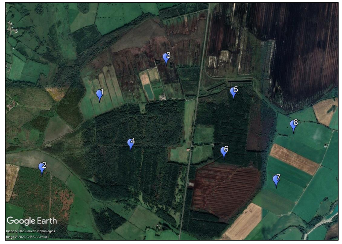
Figure 1 Proposed development layout

The proposed development layout overlaid onto aerial imagery is shown in Figure 1 below.