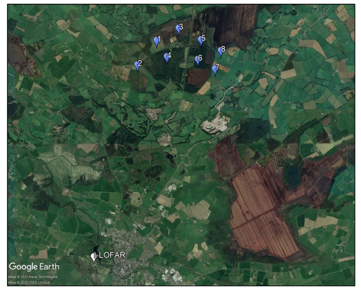
Figure 2 I-LOFAR location

The location of the I-LOFAR relative to the proposed wind development is shown in Figure 2 below.